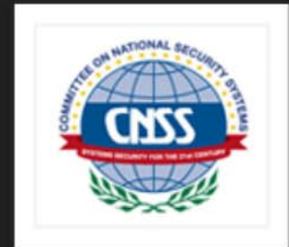
Committee on National Security Systems (CNSS)