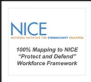
The National Initiative for Cybersecurity Education (NICE)