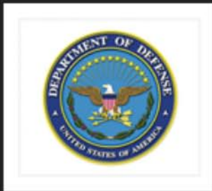
United States Department of Defense (DoD)