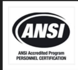
American National Standards Institute (ANSI)